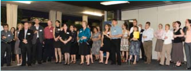
Business South Bank members during the Minister's insightful presentation

Our end of year function took place at the redeveloped Southbank Institute. Institute students and graduates cooked and served the canapés to the 120-strong attendees. Thank you to Spotless for its sponsorship of the event, and to special guest Federal Minister Craig Emerson, Minister for Small Business, Independent Contractors and the Service Economy.