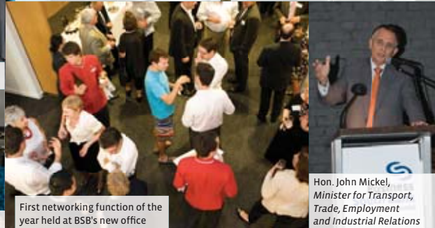
First networking function of the year held at BSB's new office