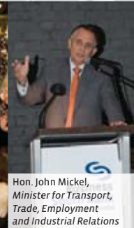
Hon. John Mickel, Minister for Transport, Trade, Employment and Industrial Relations